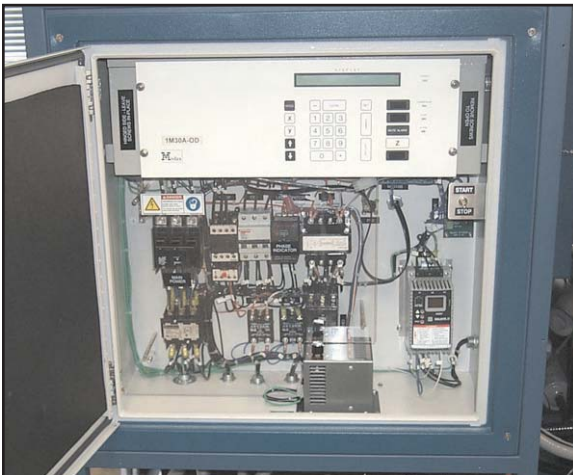
The fully enclosed and gasket sealed NEMA 4 rated electrical box.