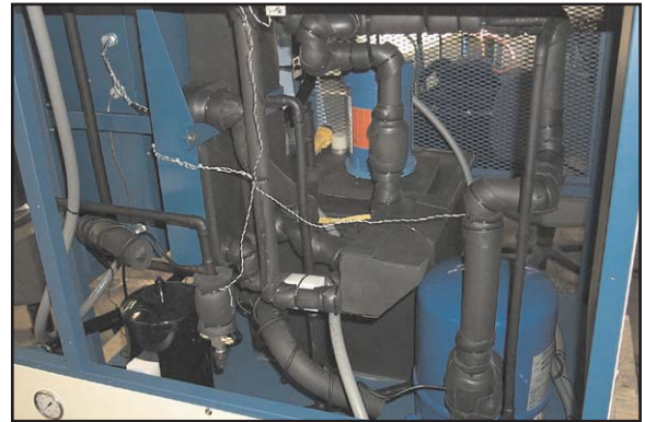
Interior View: The blue Maneurop compressor is located in the lower right. All plumbing is insulated with closed cell foam neoprene.