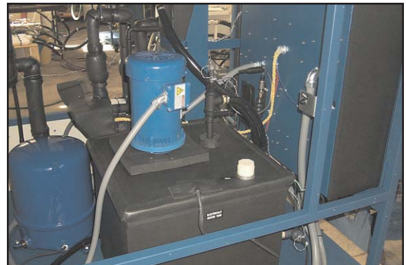
Interior View: The vertically mounted seal-less centrifugal pump of the 1M30A-OD is mounted on top of the tank. The tank fill port is behind a hinged screened door for easy access.