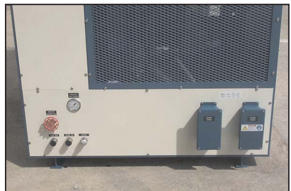
View of the bulkhead interface: fluid Input/Output, tank drain, flow adjustment, pressure gauge, interlock interface box and main power connections box.