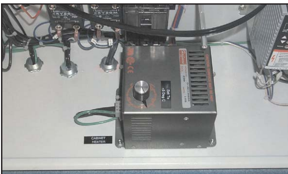
Cabinet Heater inside NEMA 4 electrical box. This heats the electrical components for starting on very cold days.